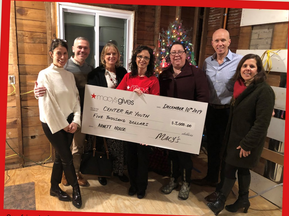
Our friends from Macy's Eastview joins our team to present a $5,000 donation to The Arnett House!