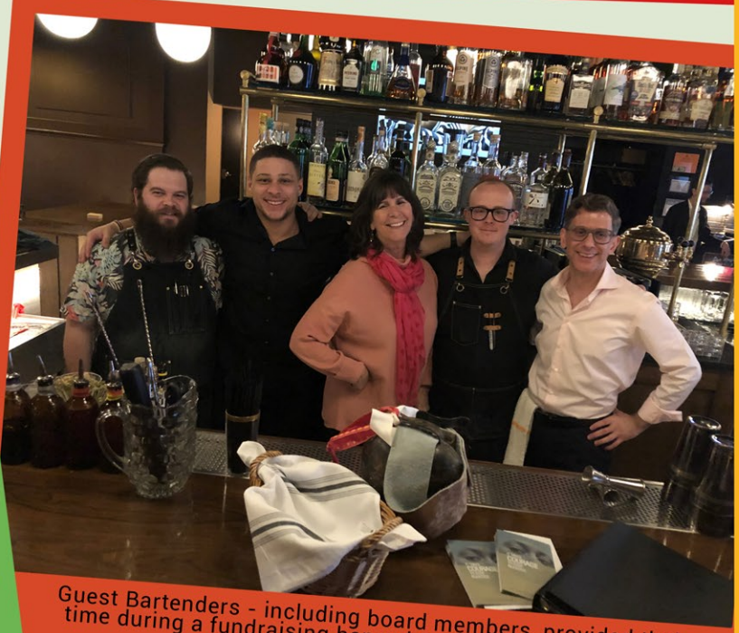
Guest Bartenders - including board members, provided their time during a fundraising happy hour event at 80W, raising nearly $2,000 in just over two hours!