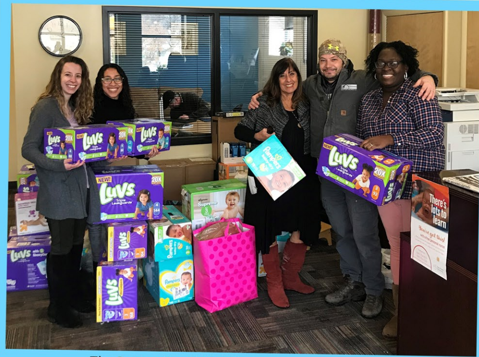
The Dutton Family holiday party provides such wonderful supplies to our Crisis Nursery program!