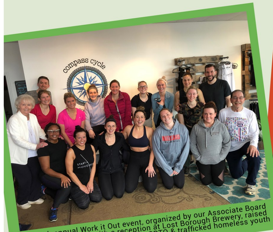
The 4th annual Work it Out event, organized by our Associate Board at Compass Cycle, with a reception at Lost Borough Brewery, raised money for our Arnett House - the LGBTQ & trafficked homeless youth residence opening later this winter.