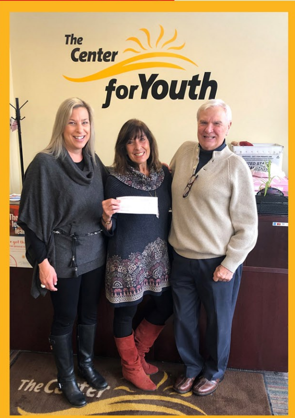
The Genesee Valley BMW Car Club stopped by to share a generous holiday donation to The Center!