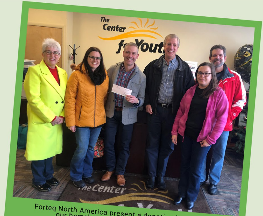
Forteq North America present a donation in support of our homeless youth programs & services.